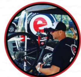
Ride & Event Support