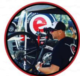
Ride & Event Support