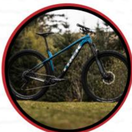
Specialized & Trek Dealer